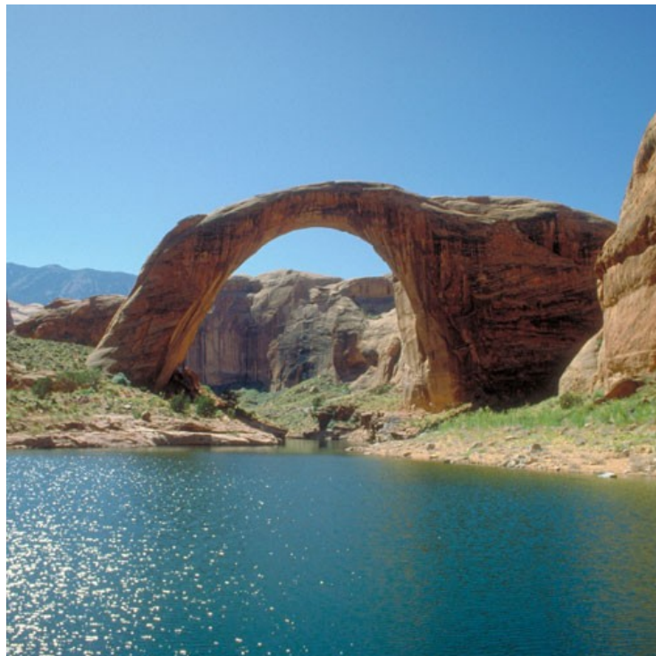
This is a picture of the Rainbow Bridge and Lake Powell.