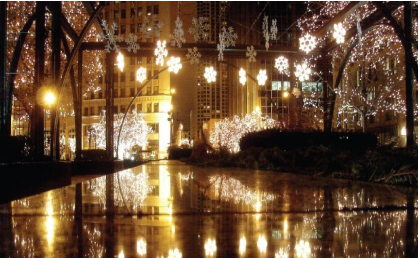
Chicago, Illinois Public Library