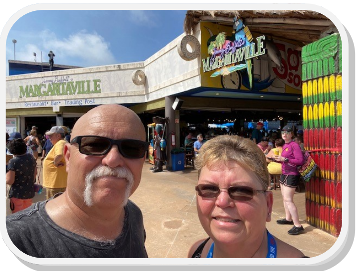
Montego Bay, Jamaica